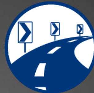
Enhanced Curve Delineation