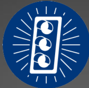
Reflective Border Backplates