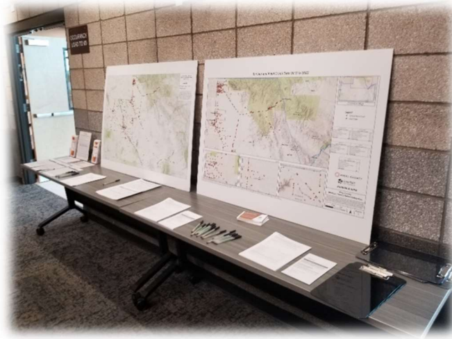
Public Open House San Tan, May 16, 2024

There was a public open house held on May 16 th at the Pinal County Administration Building at 31505 N Schnepf Rd, San Tan Valley, AZ 85143. A presentation on the Pinal County Safety Study was given; Crash Data Boards along with hard copies of a survey were available to attendees along with a study postcard with the QR code to the study Public Outreach webpage. The survey and study postcard were provided in English and Spanish.