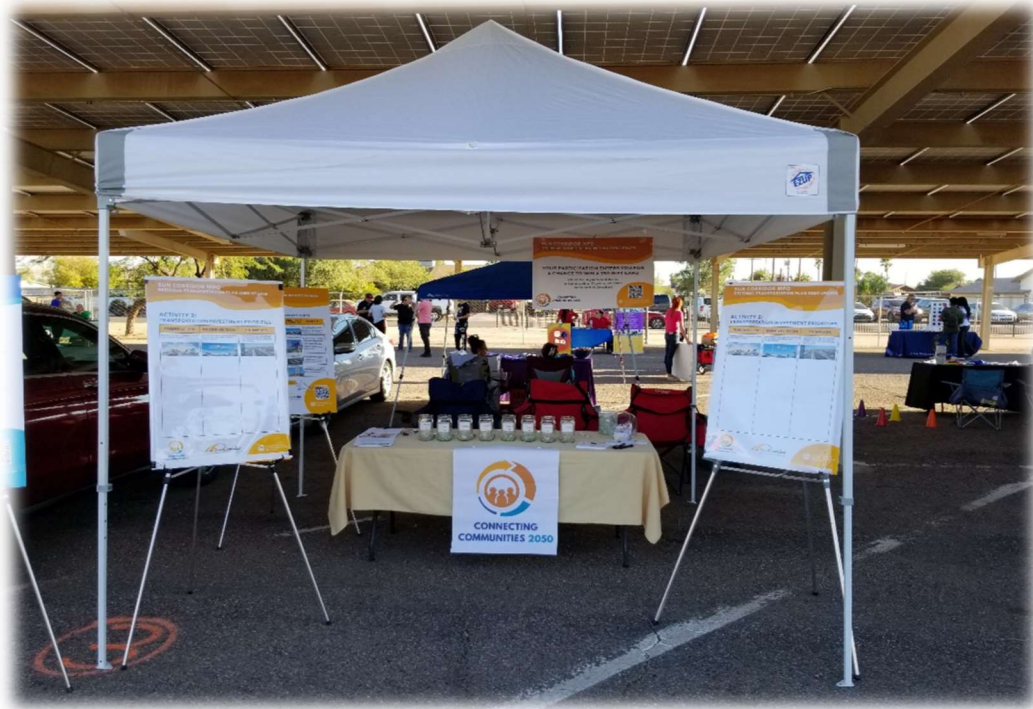
Eloy GAIN Night – October 4, 2023