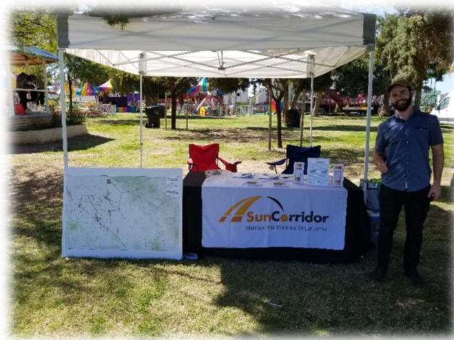
Coolidge Cotton Day’s, March 1, 2024

On March 1 st the Sun Corridor MPO staff had a booth at Coolidge Cotton Days. Crash Data Boards along with hard copies of a survey were available to event participants as well as a study postcard with a QR code that directed citizens to the study Public Outreach webpage. The webpage provided an electronic version of the survey as well as Social Pinpoint Mapping exercises where participants can drop a location pin and leave comments related to biking, walking, and driving. All public involvement materials were made available on English and Spanish. There were approximately 30 community members that visited the booth.