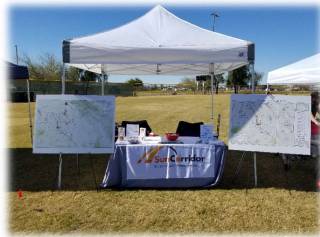
Casa Grande Public Safety Day, April 6, 2024

On April 6 th the Sun Corridor MPO staff had a booth at the Casa Grande Public Safety Day. Crash Data Boards along with hard copies of a survey were available to event participants along with a study postcard with the QR code to the study Public Outreach webpage. The booth was visited by approximately 150 citizens. All public involvement materials were made available on English and Spanish.