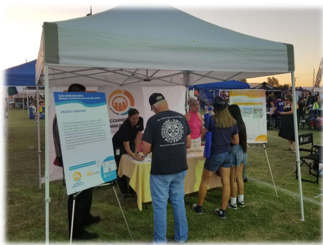
Casa Grande Silent Witness Night – September 26, 2023